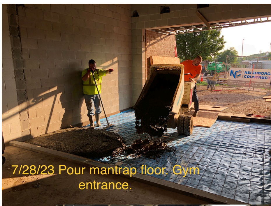
7/28/23 Pour mantrap floor. Gym entrance.