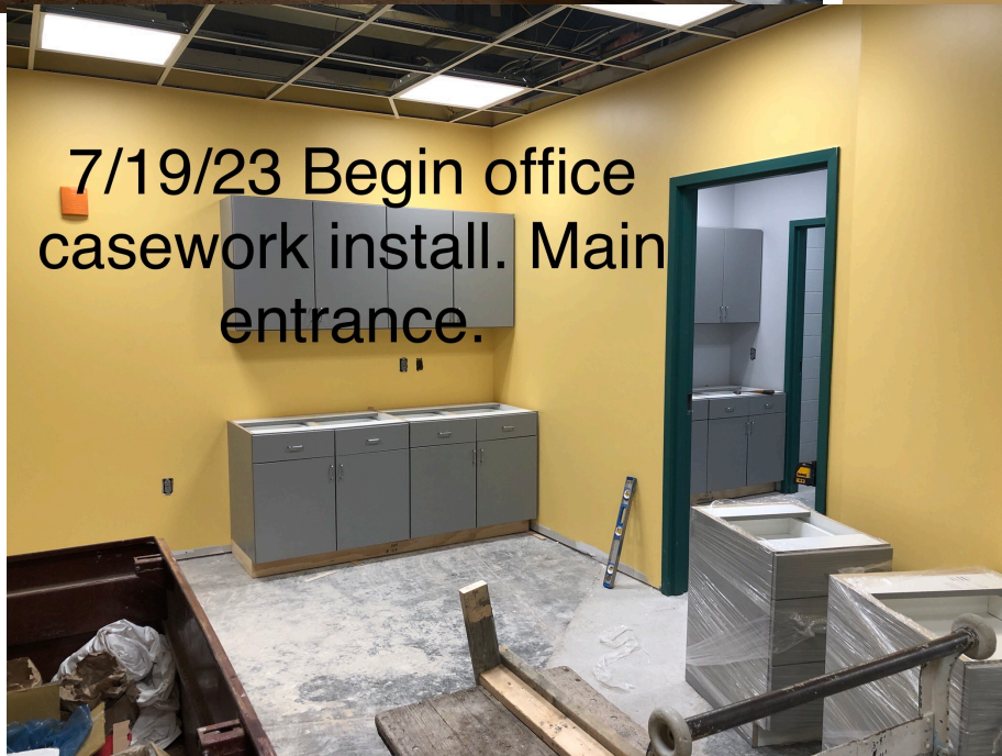
7/19/23 Begin office casework install. Main entrance.