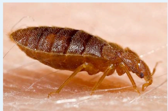
Bed bug images